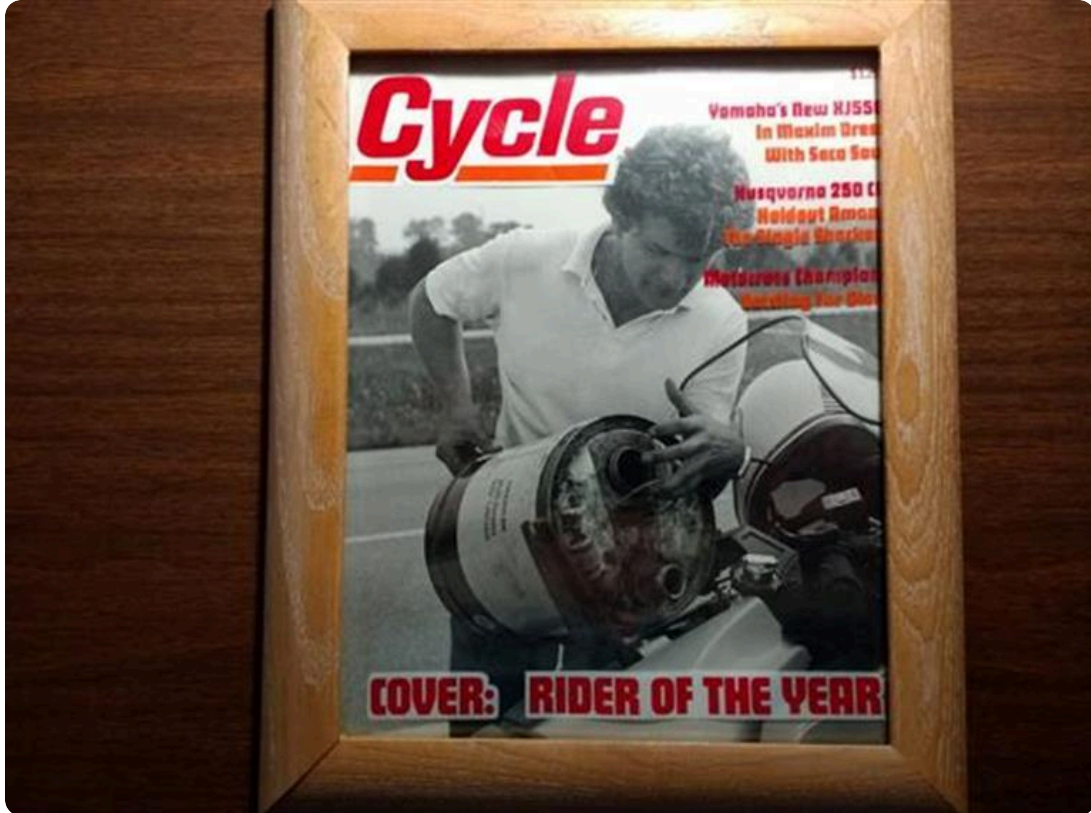
Rider of the Year